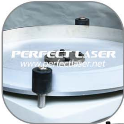
Material feeding Plate